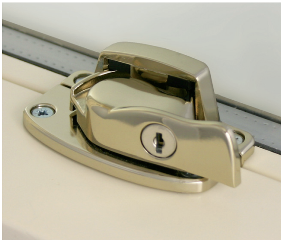
Alliance with cast keep

Alliance is suitable for all vertical sliding windows made from PVCu or timber and has various flat and cast keep designs suitable for all profiles. Available in a variety of plated or painted finishes.