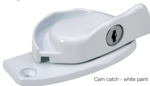
Cam catch - white paint